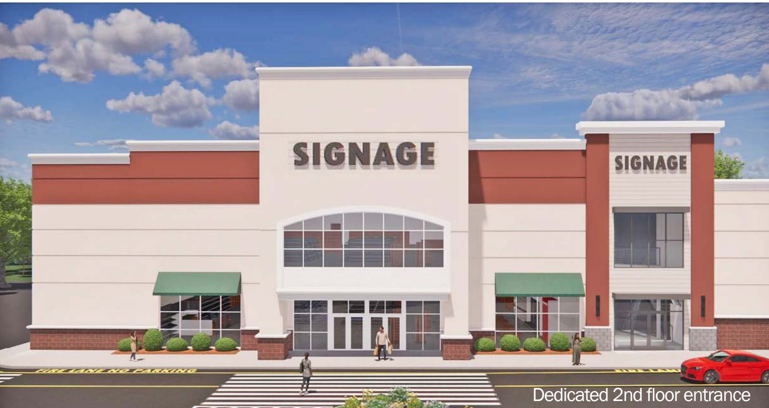
Dedicated 2nd floor entrance